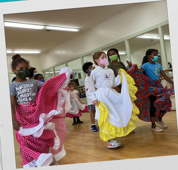
AGES 5-7 AND 7-11 SUNDAYS FEB 5 - DEC 10

This class series educates children on traditional forms of Cuban culture in a fun and energetic way! Team taught by local musician and instructor; Each class is split into two sections and will culminate in performance opportunities on May 28 and December 10