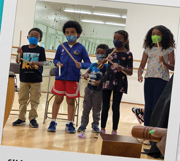
SHAWL-ANDERSON DANCE CENTER BERKELEY, CA